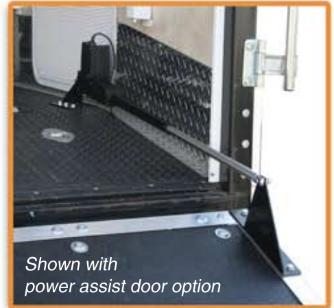
Shown with power assist door option