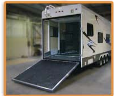
LCI ramp doors utilize a vacuum bonded construction that allows for a lighter weight, stronger door