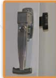
Optional side latch